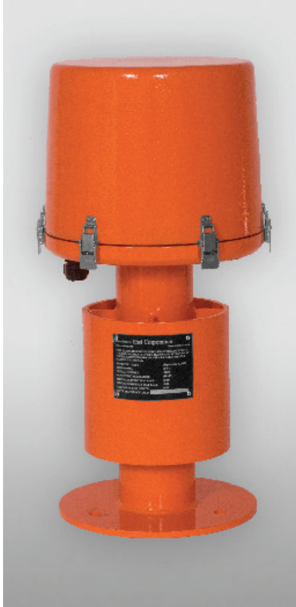
FaradicWave (FW/1) Fog Signal