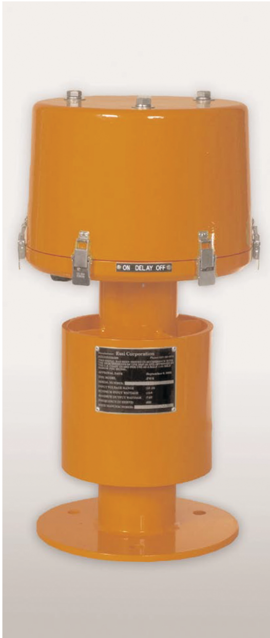
FaradicWave (FW/3) Fog Signal