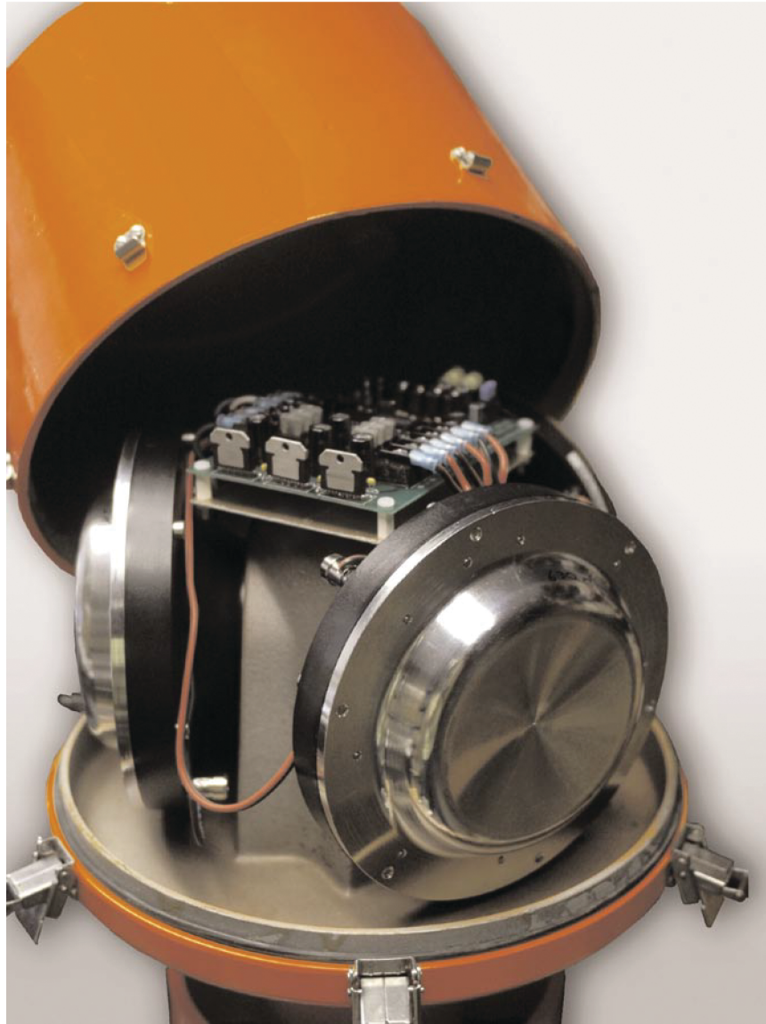
Detail shot of Central Chamber with Major Components inside